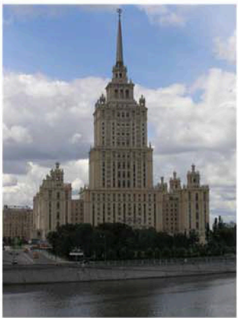
план 31.-го этажа +116.43